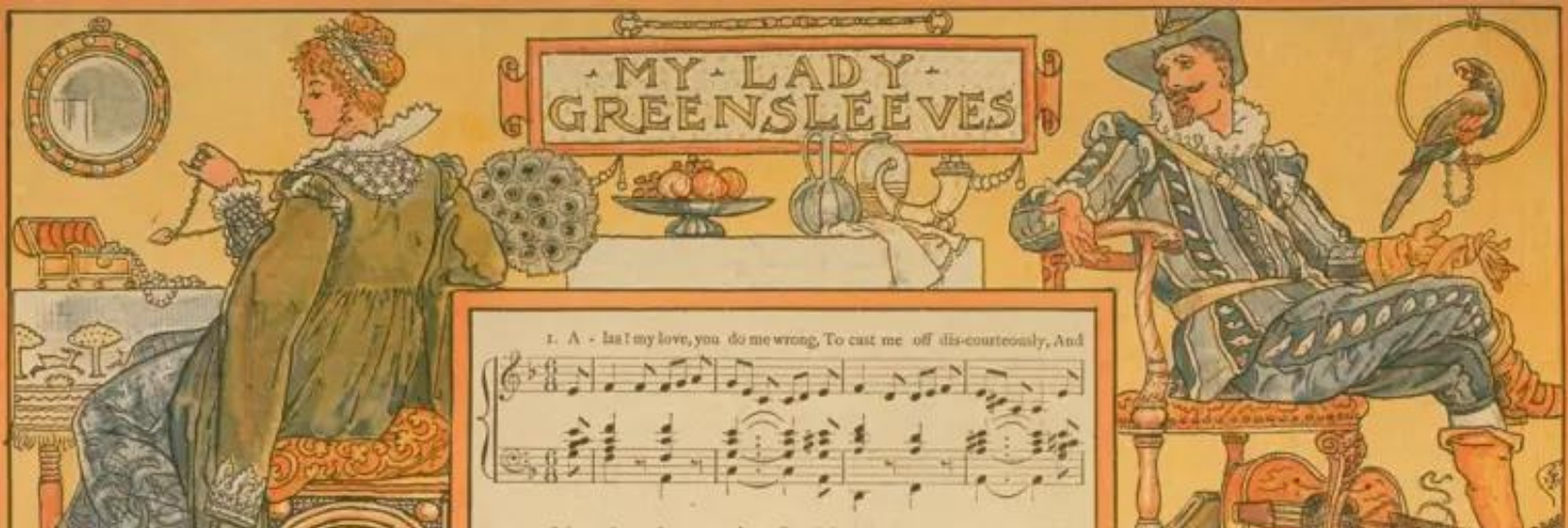
Greensleeves illustration by Walter Crane