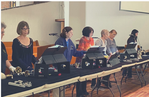
Suncoast Bronze Ringers during CD recording

Whew! So there is a LOT that goes into it all, but things are shaping up great and I hope to have our cd by May or at least in time for your Christmas shopping next fall! Look for additional information via our email mailing list (hint, hint) or our newsletter next fall.