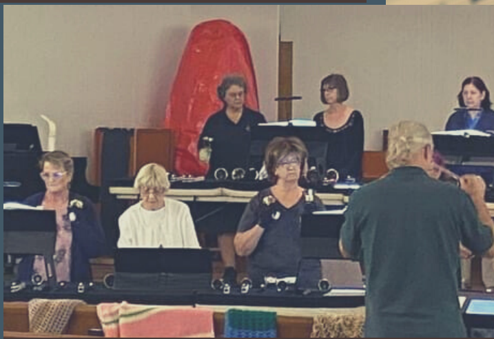
Suncoast Bronze Ringers during CD recording