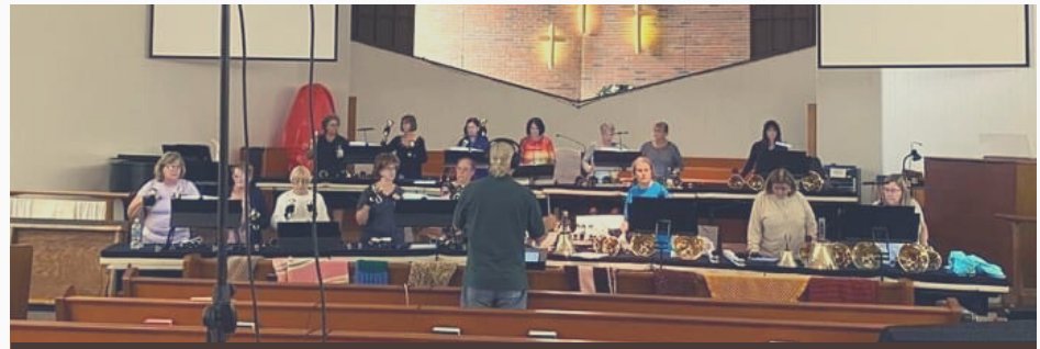
Suncoast Bronze Ringers during CD recording

DON'T MISS OUR SPRING CONCERTS! FREE-WILL OFFERING